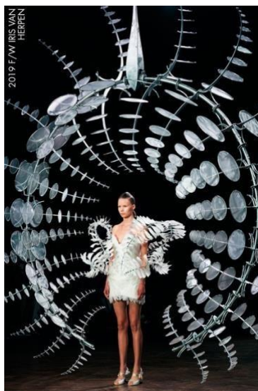
Hypnosis - Iris van Herpen - Couture - In collaboration with Anthony Howe