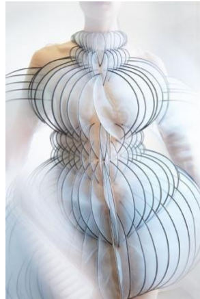
Hypnosis, Iris van Herpen

Among the cutting-edge techniques Iris van Herpen employs, laser cutting is a key method that allows for the creation of highly precise and detailed patterns on various materials. This technique enables the development of intricate and delicate designs, often resembling modern lace or geometric patterns. By using laser cutting, Van Herpen can produce complex shapes with a level of precision that would be difficult to achieve by hand. This method contributes to the architectural and futuristic aesthetic that characterizes her work, blending advanced technology with innovative fashion design.