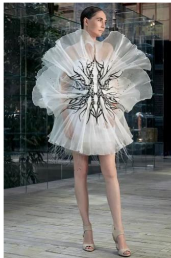
Architectonics, Iris van Herpen