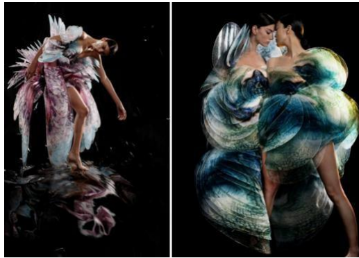
David Uzochukwu for Iris van Herpen, “Hydrozoa Dress,” Sensory Seas collection (2020). Right: David Uzochukwu for Iris van Herpen, “Sensory Sens Dress” and “Nautiloid Dress,” 'Sensory Seas (2020) collection.