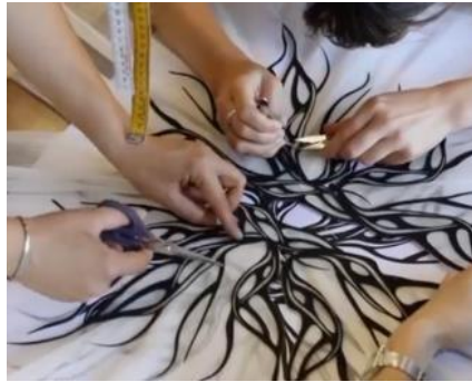
Architectonics, Iris van Herpen

Iris van Herpen employs a variety of material manipulation techniques such as plissing, folding, and welding to add shape and structure to her fabrics, resulting in a predominantly three-dimensional effect. These techniques allow her to sculpt fabrics into intricate, architectural forms that go beyond conventional clothing design. By combining these methods, Van Herpen transforms garments into wearable works of art that are both innovative and experimental. Her mastery of material manipulation not only enhances the visual complexity of her pieces but also solidifies her influence in the modern fashion world, where her designs push the boundaries of form and functionality.