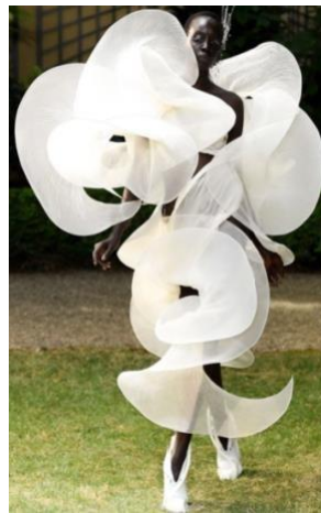
Iris van Herpen Couture Fall 2023

While Iris van Herpen is celebrated for her use of cutting-edge technologies, she also integrates traditional draping and tailoring techniques into her design process. Van Herpen works closely with skilled tailors and artisans to ensure that her garments maintain the elegance and precision that define haute couture. The use of these traditional methods, such as hand draping fabric directly on the mannequin and intricate tailoring, ensures that her designs are not only visually innovative but also possess the refined craftsmanship and meticulous attention to detail expected in haute couture. By combining advanced technology with time-honored techniques, Van Herpen creates pieces that are both futuristic and rooted in the artisanal heritage of fashion.