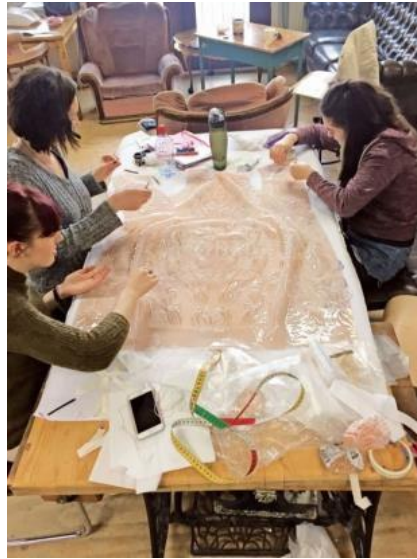
Blending cutting-edge technology with sartorial tradition, in iris van herpen's workshop to follow the detailed construction of one intricate dress.