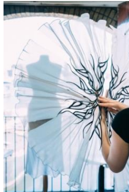
Architectonics, Iris van Herpen