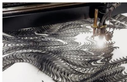
Laser Cut, Iris van Herpen