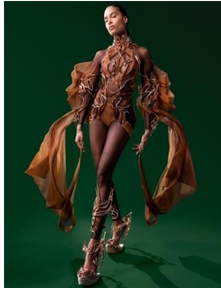
Vegan dress, Iris van Herpen