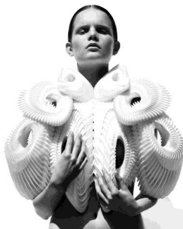
Impression 3D, Iris van Herpen

Among the techniques Van Herpen employs, 3D printing stands out as one of the most iconic. Using this technology, she creates intricate structures and shapes that are impossible to produce through traditional methods. These designs often have an architectural and futuristic quality, setting her apart as a visionary in the world of haute couture.