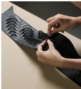
Tailoring sewing technique, Iris van Herpen