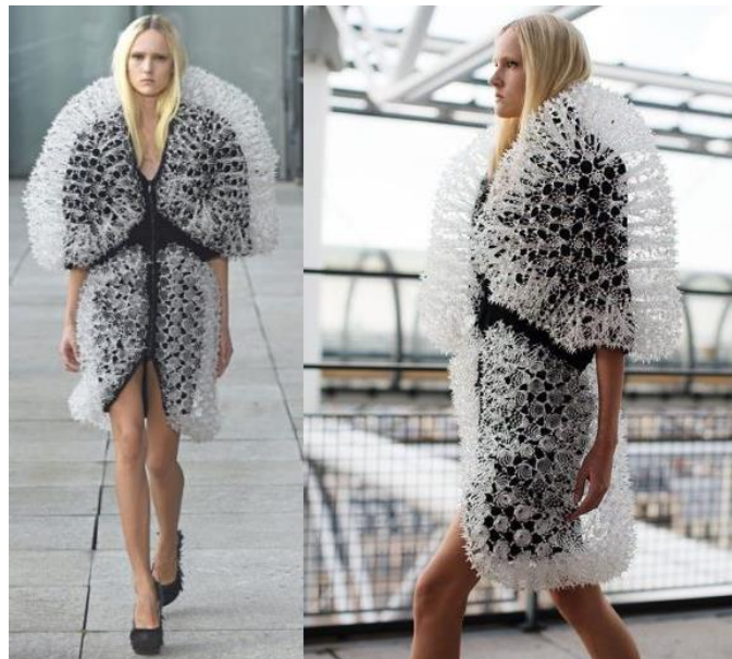
Magnetic Motion SS 2015, Iris van Herpen