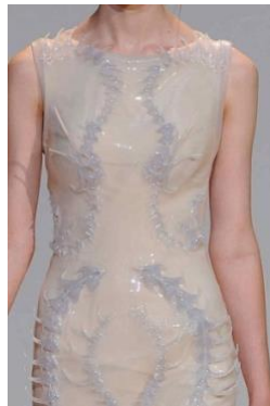
Latex Dress, Iris van Herpen

In addition to utilizing advanced technologies like 3D printing and laser cutting, Iris van Herpen frequently experiments with unconventional materials such as silicone, plastic, metal, and magnetic elements. These experimental materials enable her to create unique textures and visual effects that are rarely seen in traditional fashion design. By pushing the boundaries of material usage, Van Herpen achieves innovative and otherworldly designs that emphasize both the aesthetic and tactile qualities of her garments. This approach not only enhances the visual impact of her pieces but also allows for greater experimentation in terms of form and structure, reinforcing her status as a pioneer in haute couture.