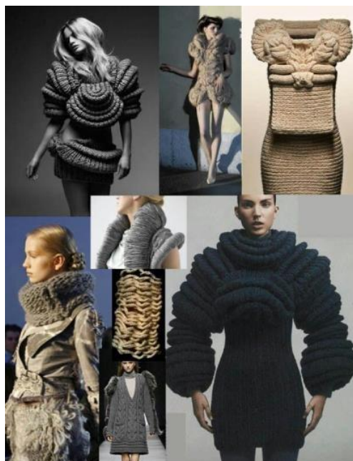
Knitted, Iris van Herpen

Iris van Herpen masterfully combines modernized weaving and knitting techniques with cutting-edge digital technology to create dynamic and complex textures in her designs. These advanced techniques, when paired with traditional craftsmanship, result in fabrics that appear to move and come alive in unusual, organic ways. The interplay between digital precision and traditional weaving or knitting allows Van Herpen to craft garments that push the boundaries of textile design, producing fabrics with fluid, intricate patterns that are both visually captivating and structurally innovative. This fusion of modern technology with age-old techniques exemplifies Van Herpen's unique approach to fashion, where the old and new coalesce to produce something truly avant-garde.